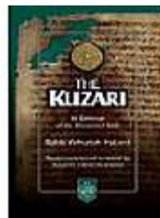
Books from our Library Page 5