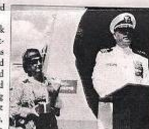
A proud moment.