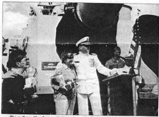
The author with a former student who never forgot his second-grade teacher.

Incidentally, I do remember him in my class. He was bright, shy and well mannered. He was also very proud of the fact that he had learned to write his name in Hebrew and he proudly demon-