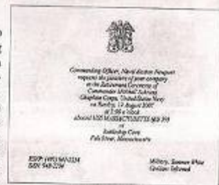
An official invitation.