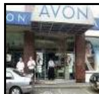
Avon Has Left Page 7

If you can not read the attached PDF file, please go to the below link and download Adobe Reader for free: