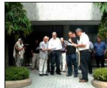
Praying Prior to Birkat Hachama Prayers